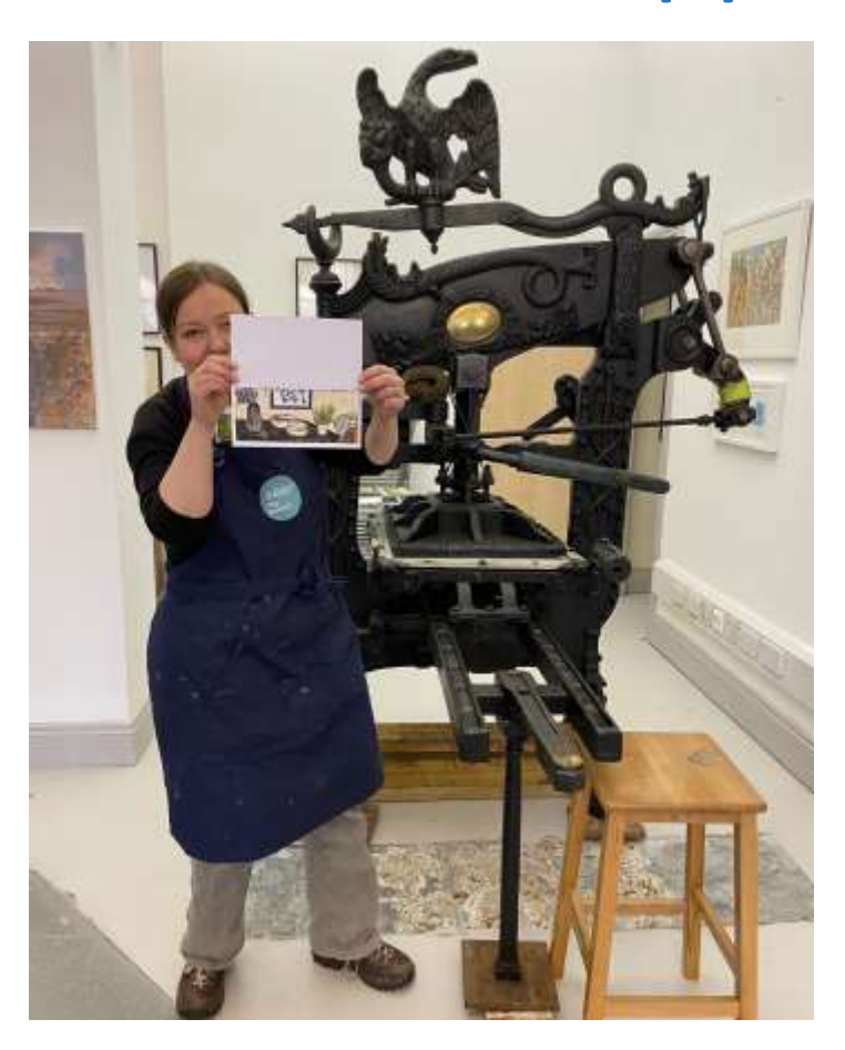
Seacourt Print Workshop Bangor, Co. Down