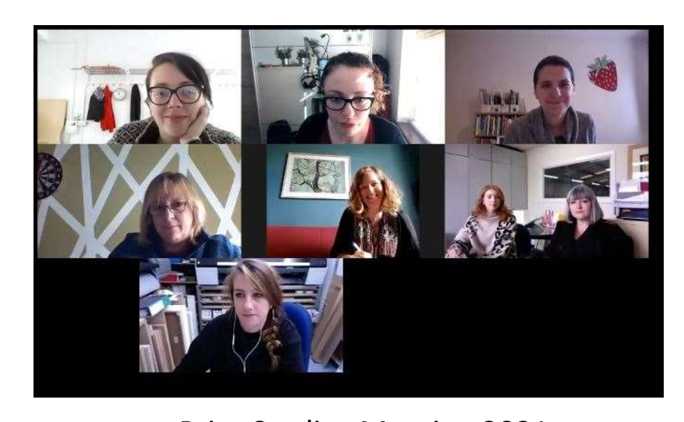
Print Studios Meeting 2021

Our proposal is to support the development and formalisation of the Print Network of Ireland: a network of professional print studios spanning the Republic of Ireland and Northern Ireland. We have identified and connected with a number of other organisations to form the Print Network of Ireland: Belfast Print Workshop (NI); Seacourt Print Workshop, Bangor, Co. Down (NI); and Creative Spark Print Studio, Dundalk, Co. Louth.