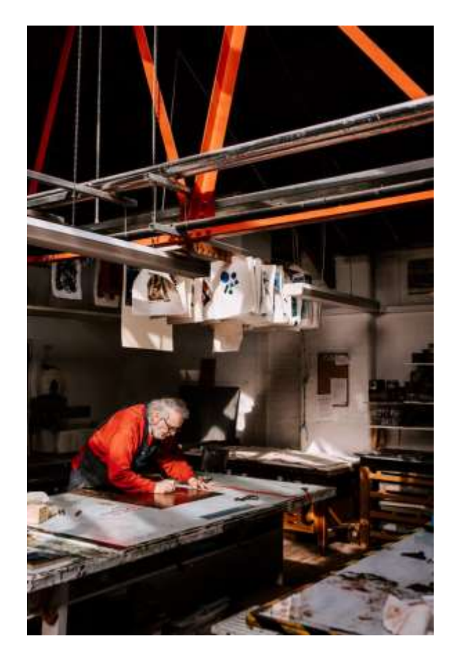
Belfast Print Workshop Belfast, Co. Antrim